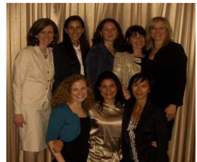
ITPCC team at The Columbia Club