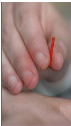
Acupuncture at the clinic